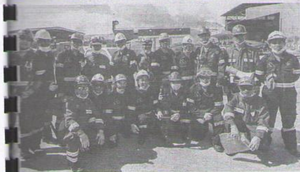
Emergency Response Team (MERT) of Carmen Copper Corporation helped authorities in the search and rescue following a massive landslide that hit the City of Naga on September 20 last year.