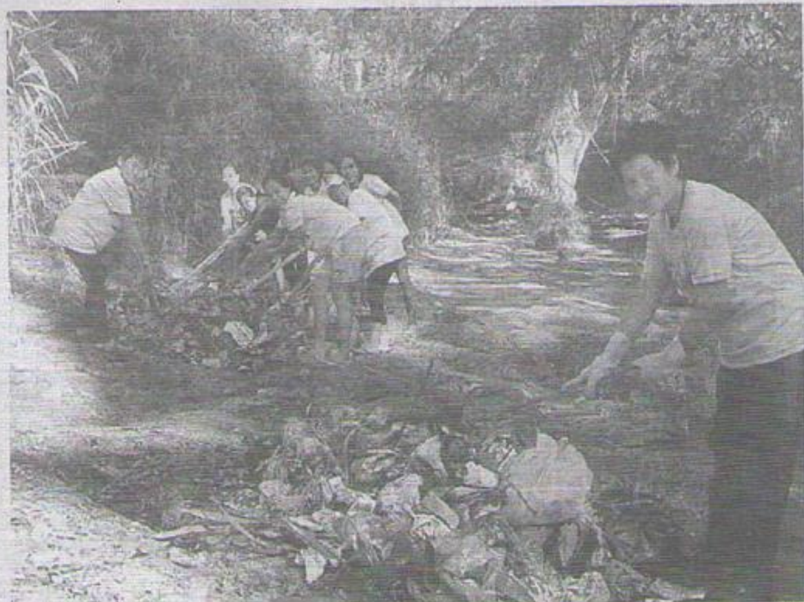
The Hugpong Cantabacoanon Para sa Kinilyahan of Barangay Cantabaco, Toledo City spearheaded the cleanup activity of Cantabaco River during Carmen Copper's Linis Estero last February 23.