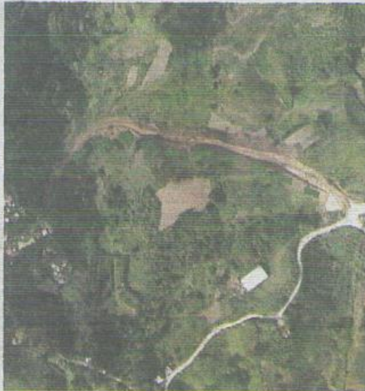
MAP OF NEW ROAD. Aerial view of Carmen Copper's ongoing road opening project from Sitio Danawan to Sitio Hag-it in Barangay Biga, Toledo City. COURTESY OF PHOTO

The increase in local employment has also provided opportunities for small businesses to emerge and thrive