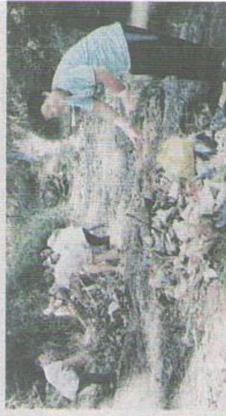
RESPECTING RIVER. Hugpong Cantabagonon para sa Kinaiyahan members clean the river in Barangay Cantabago, Toledo City to prevent it from dying and to preserve it for the future generation.

Last Feb. 22, Carmen Copper sent its volunteer-employees to participate in the simultaneous river cleanup in Barangay Luyang, Carmen. They collected 5,180 kilos of garbage. S