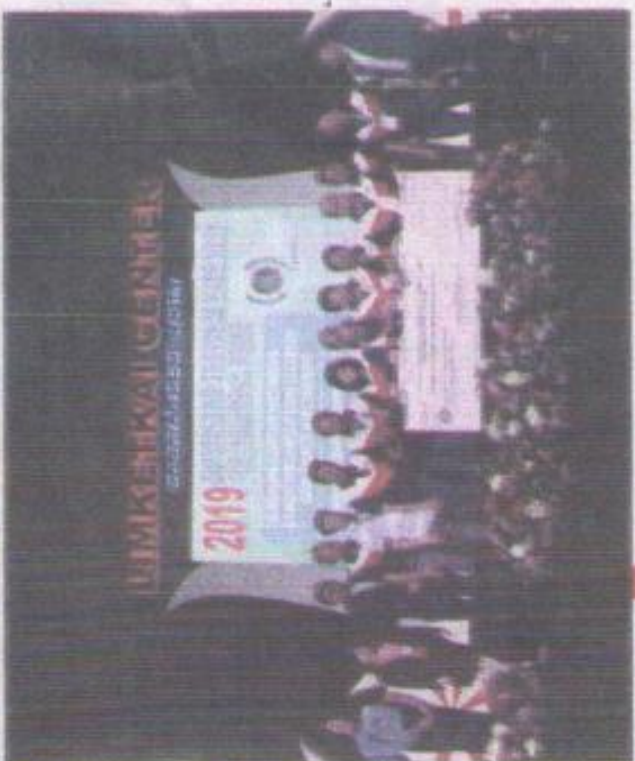
HONORED. The Carmen Copper Labor Management Relations Committee—composed of the Carmen Copper Human Resource and Legal team members and officers of Carmen Copper Workers' Labor Organization—receives the Outstanding Grievance Machinery for Industrial Peace Award during the 21st

The mining firm was recently cited for Most Improved Safety Performance for achieving the highest improvement in safety and health programs implementation and accident statistics by the Philippine