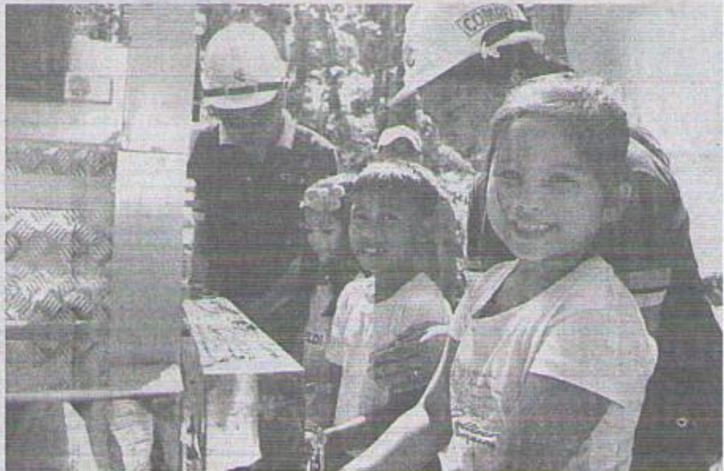
Pupils of Buswang Elementary School in Barangay Cambang-ug, Toledo City now enjoy clean and safe water with the installation of the Aqua Tower in their school, a partnership project between Carmen Copper Corporation and Planet Water Foundation.

The Aqua Tower is a sustainable water solution